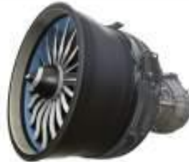
GEEnx jet engine