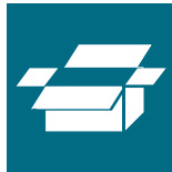
Product and Civil Liability