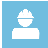
Labor and Employment