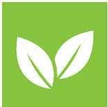
Environment and Energy

All over the country and around the world—from state supreme courts, to federal district courts, to the U.S. Supreme Court and the European Court of Justice—when there is a case to be made to protect hard-won legislative gains and expand opportunity for manufacturers, we will be there—and we will win.