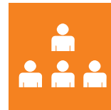
Corporate Governance and Shareholder Liability