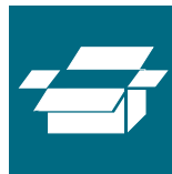
Product and Civil Liability